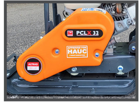
8HRS+ SAFE MACHINE