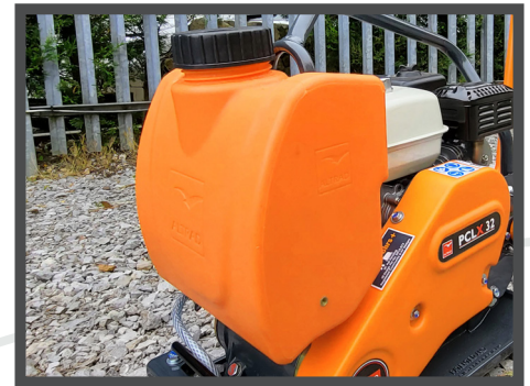
OPTIONAL 12 LTR QUICK-RELEASE WATER TANK